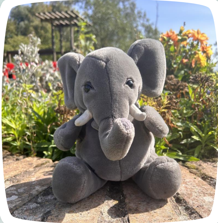
Adventures with Elliot